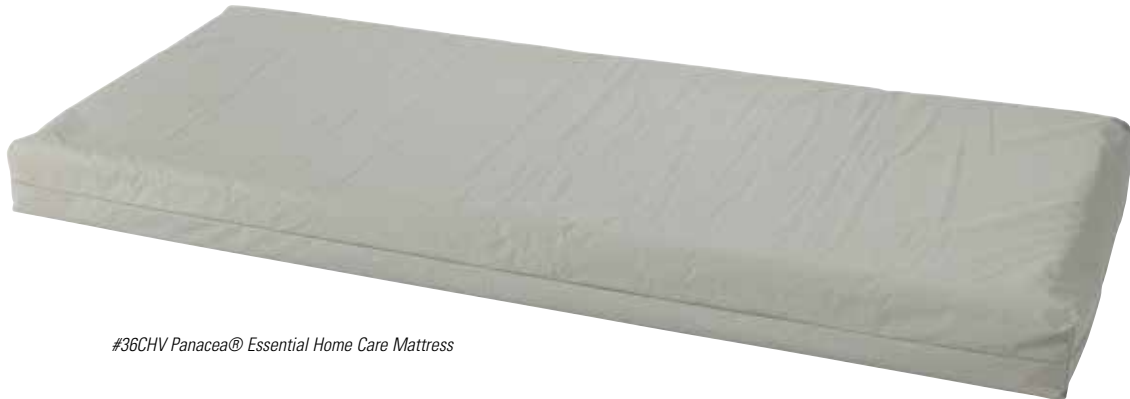
#36CHV Panacea® Essential Home Care Mattress